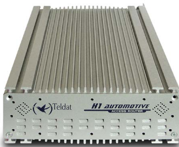
Teldat H1-Automotive Router: Front panel