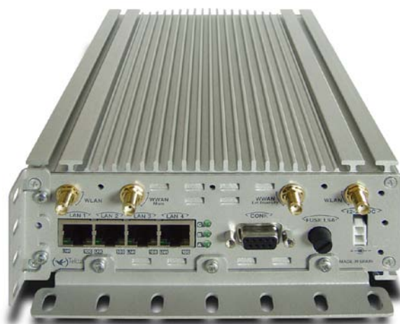
Teldat H1-Automotive Router: Rear panel