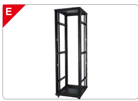
Solid structure is easly assembled.