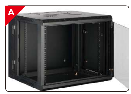
Welded structure can be easy assembled.