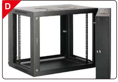
Swing frame allows the cabinet to swing away from the wall for easy access to equipment and cabling.