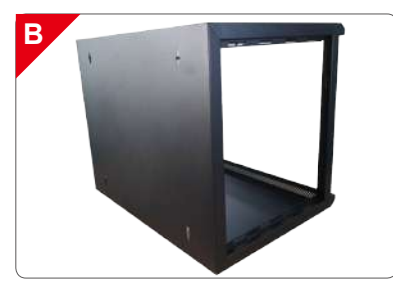
Fixing holes use to fix the rack to wall for all wall box