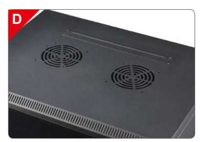
120mm*120mm fans can be preinstalled on the top cover.