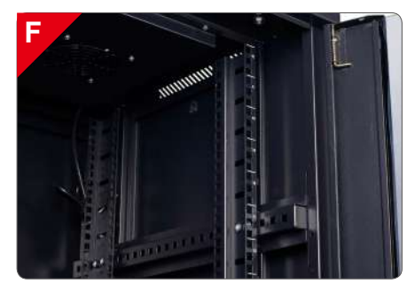
Front and rear sets of vertical rails adjust in quarter inch increments. Adjustment is quick and convenient. Simply unscrew the rails, adjust them to the required depth and re-fasten.