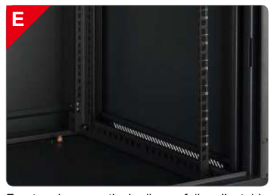
Front and rear vertical rails are fully adjustable