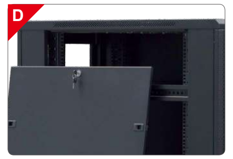
Lockable and removable side panels.