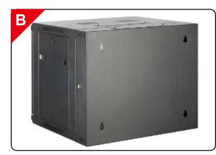
Slots in back ensure convenient and quick wall mounting.