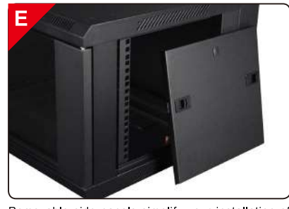
Removable side panels simplify your installation of accessories and monitoring of IT equipment.