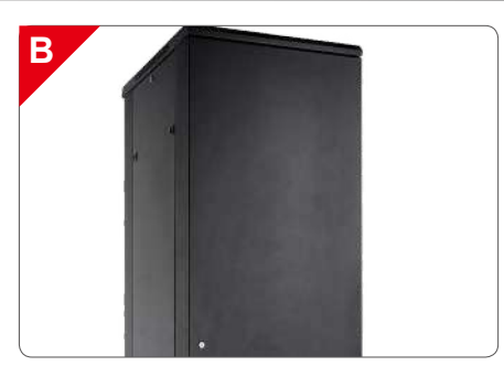
Lockable Rear Door.