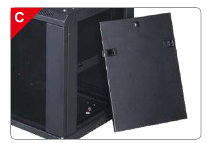
Removable and lockable side panel simplifies your installation