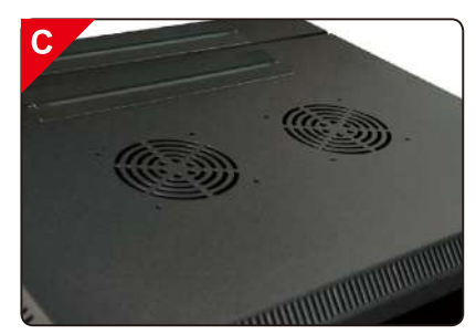
120mm*120mm fans can be preinstalled on the top cover. Relevant fan tray suit to all safewell wall mounted cabinets. (Brush panel is optional for cable entry panel.)