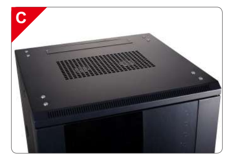
Optional Fan tray(2 fans for 600mm,4 fans for 800mm or 1000mm deep rack) allow air flow in the cabinet.