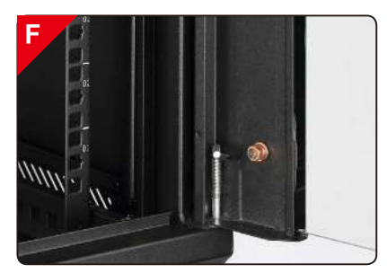
L-shaped spring pin make it fast to install front door to the frame and easily to change door opening direction.