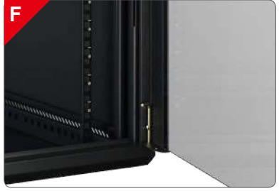
180 Degrees opening angle & can be mounted on left or right hand side with simple spring latch