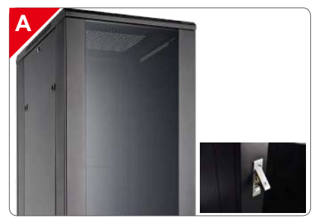
The tempered glass door.