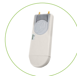
ePMP 1000 GPS Sync Radio

Using the 5 GHz frequency spectrum, the new ePMP architecture is the most effective connectivity solution for reaching the under- and unconnected around the world.