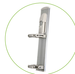
ePMP 1000 GPS Sync Radio Integrated with a Sector Antenna