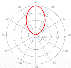
V/H - Port Pattern Azimuth 5.6 GHz