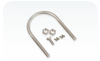
K-70 fastening set