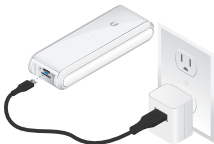
USB Power Connection Diagram

Connect the USB cable (not included) from the UniFi Cloud Key directly to a USB power source (5V, minimum 1A).