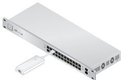
UniFi Switch Power Connection Diagram

The UniFi Cloud Key can be powered by a UniFi Switch or other 802.3af-compliant switch.