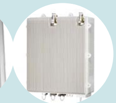
MacroMAXe All Outdoor Macro Base Station (16e)