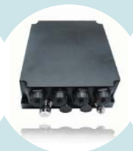
MRT Trunk-loaded Auto-powered CPE (16d)