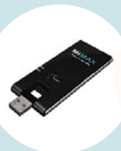
MiMAX USB (16e)