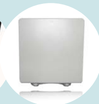
MiMAX Pro Outdoor CPE (16e)