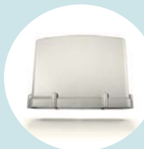
ProST Outdoor CPE (16d) (Wi-Fi option)