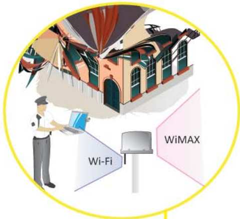
Ad-hoc/Disaster Recovery WiMAX CPE with Wi-Fi hotzone