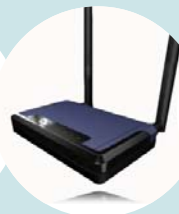
MiMAX Easy Indoor CPE (16e)