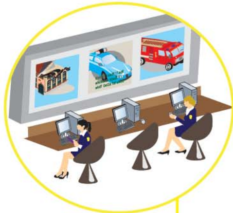
Control Center WiMAX Network Management, CCTV Camera feed, and Agency Coordination