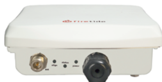
Firetide Wireless Bridge connectors