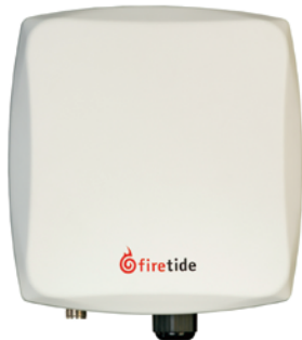
Firetide Wireless Bridge

FWB-100 product line is a natural expansion of Firetide's core wireless infrastructure technology. Firetide's expertise in large-scale wireless mesh networks for video, data and voice applications in harsh environments ensures that its bridges are optimized to provide the highest performance, security and reliability in the industry.