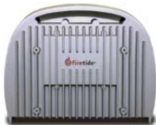
HotPort 6200-900 Outdoor Mesh Node