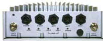
Outdoor HotPort 6200-900 connectors