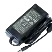
24V 2.5A Power adapter