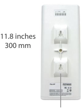
Screw-Holes for Wall Mounting (screws not included)