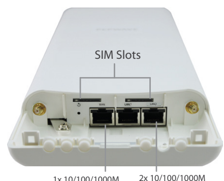
1x 10/100/1000M Ethernet WAN (PoE Input*)