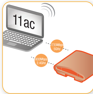
Blinding Fast 4-Stream 802.11ac