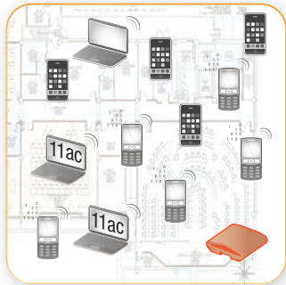
Ultra High User Density