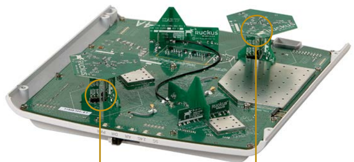
BeamFlex+ Adaptive Antenna Technology