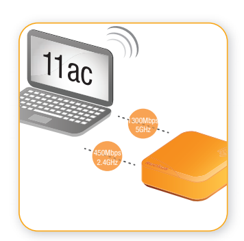
Blinding Fast 3-Stream 802.11ac