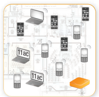
Ultra High User Density