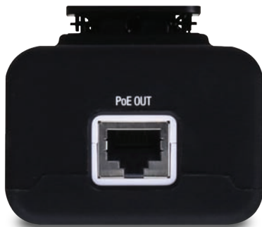
PoE Out Port

Rubber Case Clip Use the clip on the back of the rubber casing to secure the U-Installer to a belt or pocket.